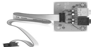
Figure 1-4 (Optional) 6 Channel Audio Adapter card